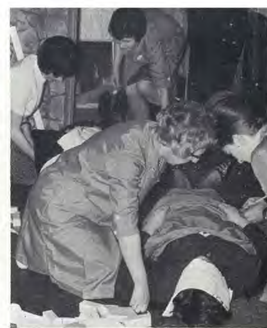
Chaos after an explosion. Then the Chester Ladies' First-Aid team goes into action.