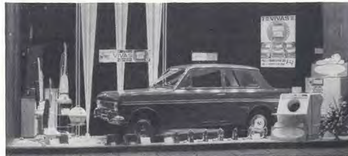
"How much is that Viva in the window?" The attractive and eye-catching display in our Birkenhead Service Centre window.

Car parking presents quite a problem these days, what with double yellow lines and finding sixpences to feed the meters, but